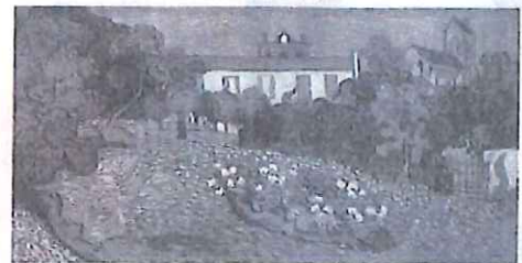
Le Jardin de Daubigny Vincent Van GOGH (1890) in the collection of Hiroshima Museum of Art.

You can appreciate 90 pieces of French modern art such as Daubigny's Garden by Vincent van Gogh and Monet and Renoir. You can also appreciate the special Exhibition by Daubigny (Charles-François Daubigny) being held at the moment.