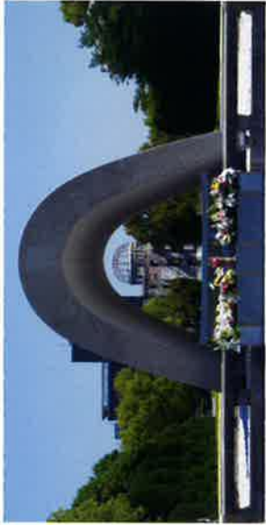
Hiroshima Peace Memorial Park (approx. 500m North)

Only 5 min walk to Hiroshima Peace Memorial Park Convenient access to the city center Perfect for sightseeing and business