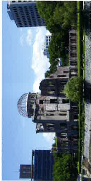
Atomic-bomb Dome (approx. 1.3km North)