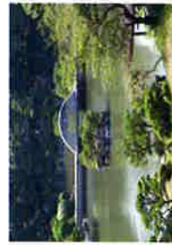
Shukkeien Japanese Garden (approx. 2.9km)