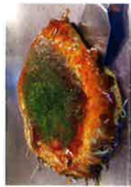
Okonomiyaki restaurant (approx. 100m)