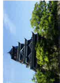
Hiroshima Castle (approx. 2.3km)