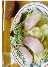
Ramen noodle restaurant (approx. 100m)