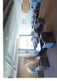
Lobby (8th floor)

○ 28 single rooms ○ 12 twin rooms ○ 2 special twin rooms ○ 11 twin rooms for the physically challenged ○ 4 Japanese-style rooms / 4 rooms (2 rooms for 3 people / 2 rooms for 4 people) Equipment (all rooms) / Flat TV, Refrigerator, Free Wi-Fi, etc. Others / Coin-operated laundry (7th floor), Vending machines (7th/8th floor), Public pay-phone (1st floor), Ice machine (8th floor)