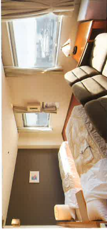
Special twin room